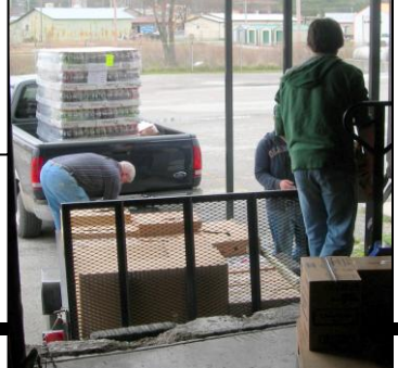
Right: Loading items for a church.